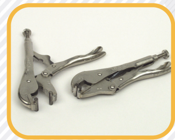
Air Test Clamps

Low-cost Standard replacement needle with sharp pointed tip and cross-hatch hole.