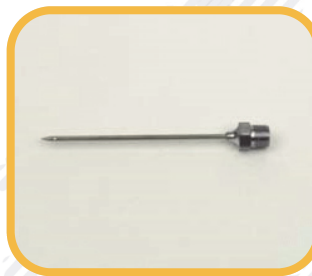
Replacement Needle, 4 1/2"

Exclusive shut off valve prevents possible leakage through the air filler valve. Accurate 0-60 PSI gauge with easy to read graduations.